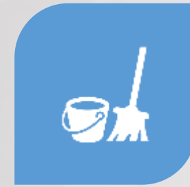
SATOL 103 – CARPET DETERGENT